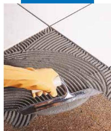
Installation of single-fired tiles on cork

N.B. The technical data of Kerabond mixed with Isolastic are on the latter's technical data sheet.