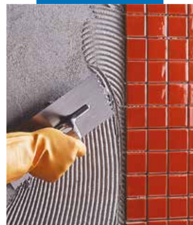
Installation of mosaic ceramic on wall