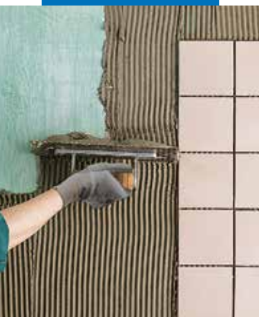
Laying on gypsum treated with Primer G