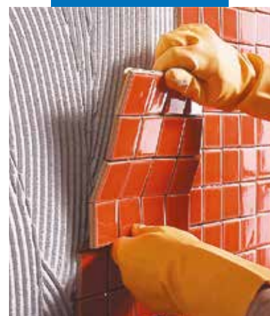
Installation of mosaic ceramic on wall