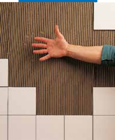
Open time expired