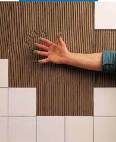
Open time still good

Mosaics and small size tiles (trowel No. 4/5): 2-3 kg/m 2 .