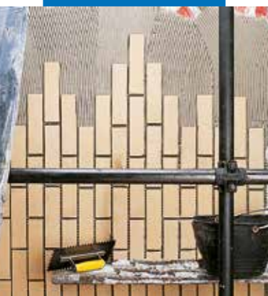
Exterior wall fixing